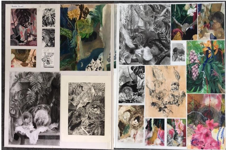
Rosetta Brown – Excellence, Level 1 Visual Art