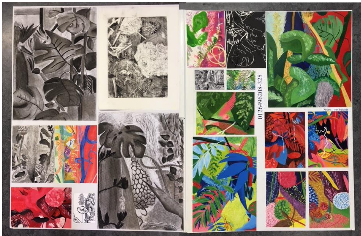
Arwen van Pallandt – Excellence Level 1 Visual Art